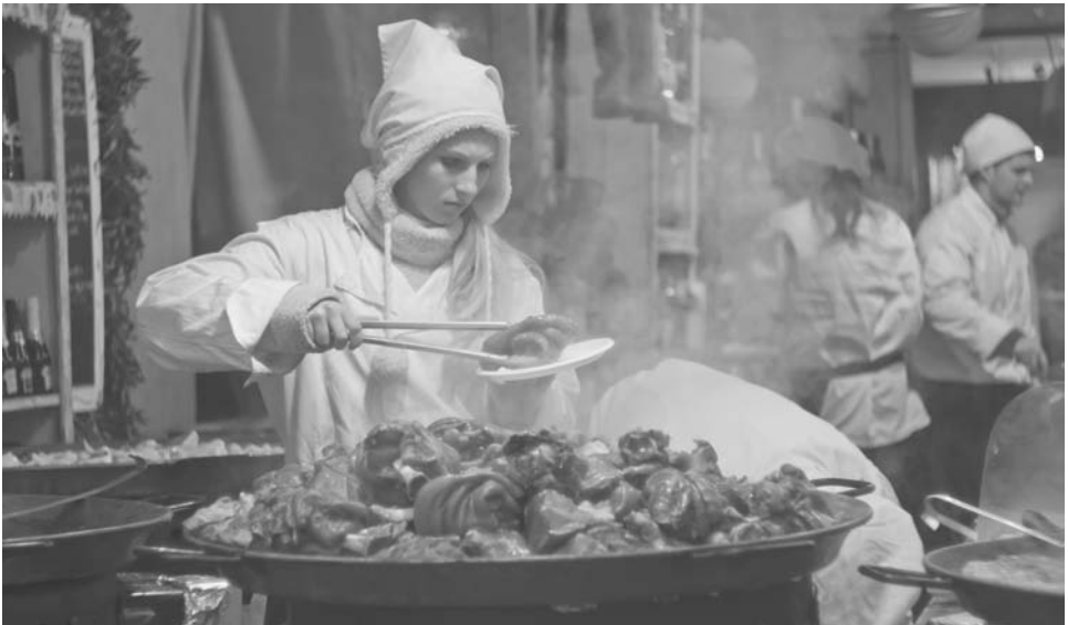
A woman serves a traditional grilled meat dish at a fair on Vorosmarty Square in Budapest, Hungary.

Kolbász is sold in stands and kiosks and served in a szendvics , or grilled sandwich and as a hot dog or wimpi (the sausage is served on an open-faced bun) accompanied by bread, pickles of choice, and mustards or other condiments. Especially interesting is the mangalica kolbász (szendvics) , made of the meat of the special, particularly flavorful and fatty, velvety-and-gamey-in-taste Mangalica Hungarian pig.